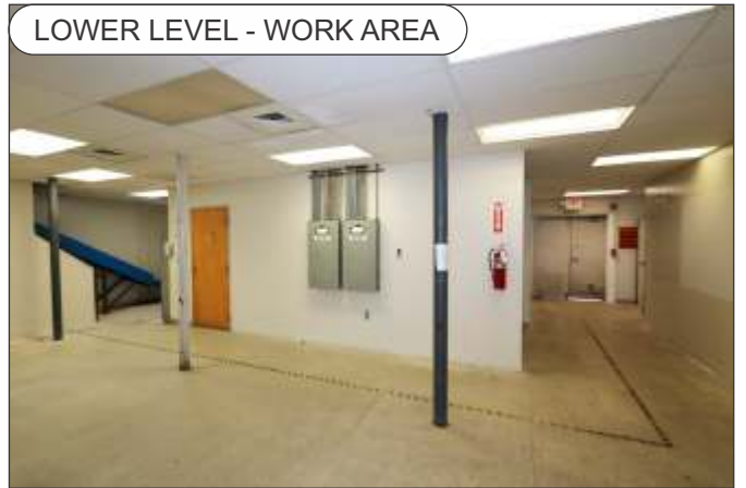
LOWER LEVEL - WORK AREA