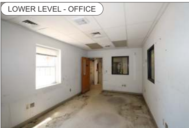
LOWER LEVEL - OFFICE