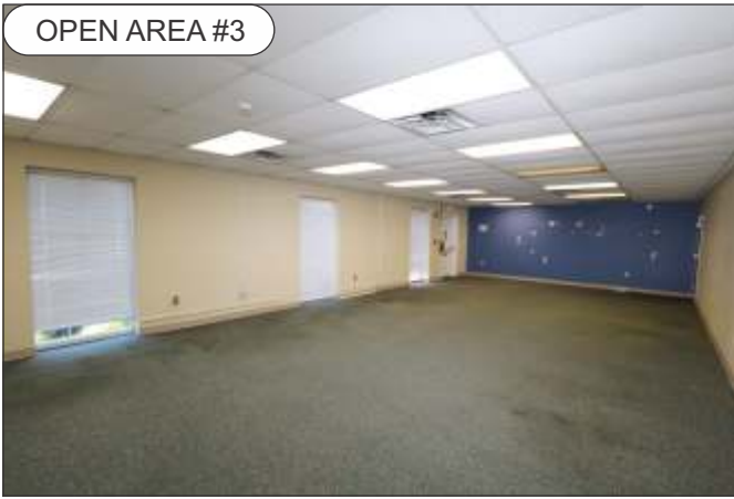
OPEN AREA #3