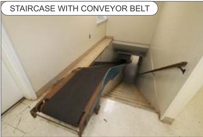
STAIRCASE WITH CONVEYOR BELT