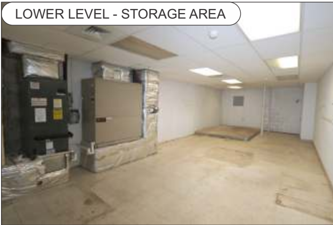
LOWER LEVEL - STORAGE AREA