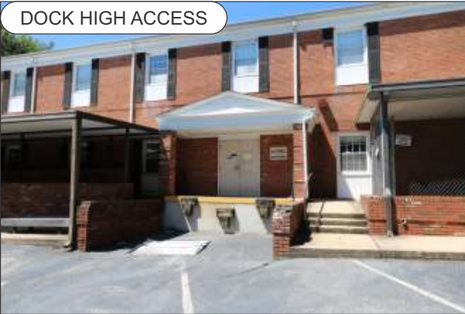
DOCK HIGH ACCESS