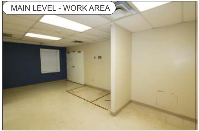
MAIN LEVEL - WORK AREA