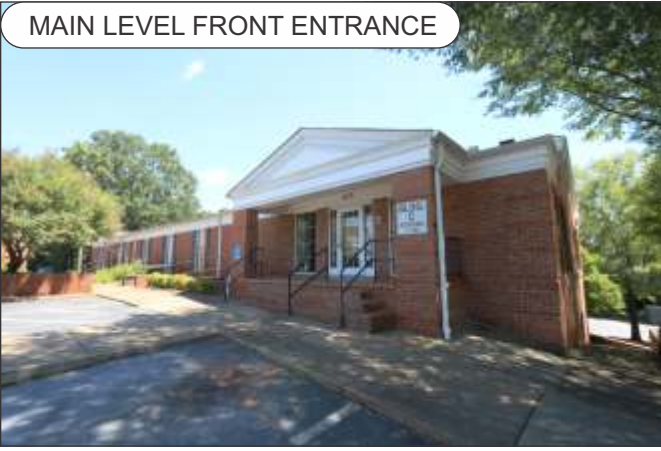
MAIN LEVEL FRONT ENTRANCE