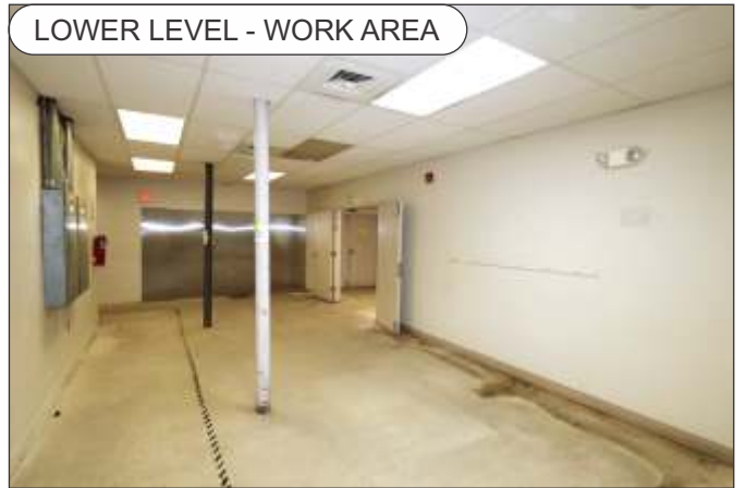
LOWER LEVEL - WORK AREA