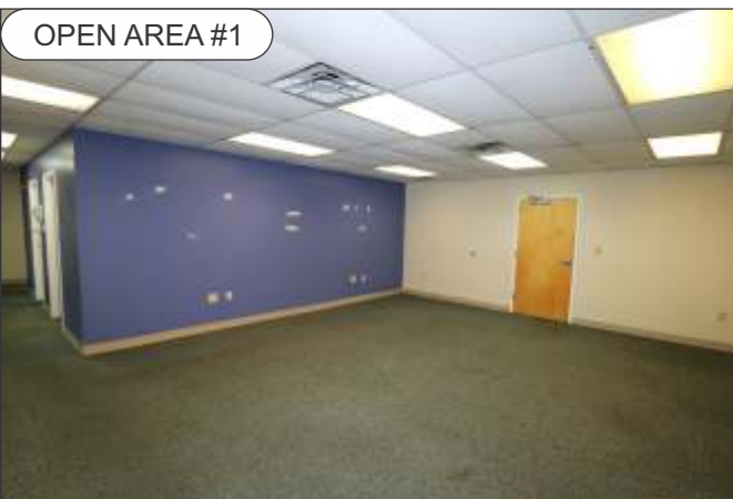
OPEN AREA #1