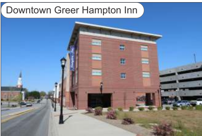
Downtown Greer Hampton Inn