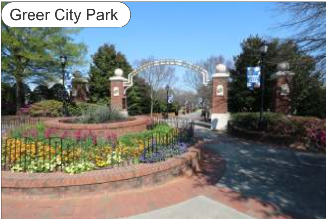
Greer City Park