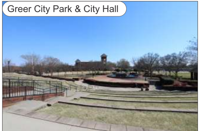
Greer City Park & City Hall