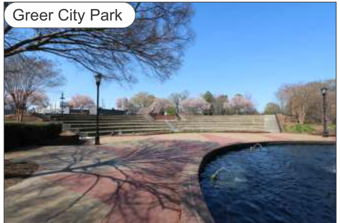
Greer City Park