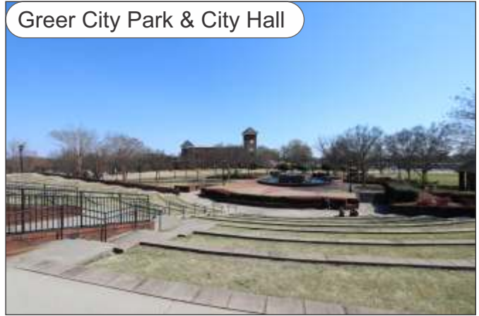
Greer City Park & City Hall