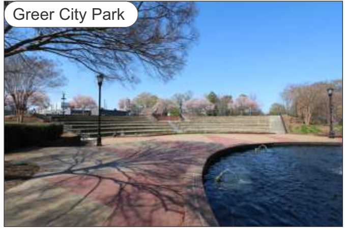
Greer City Park