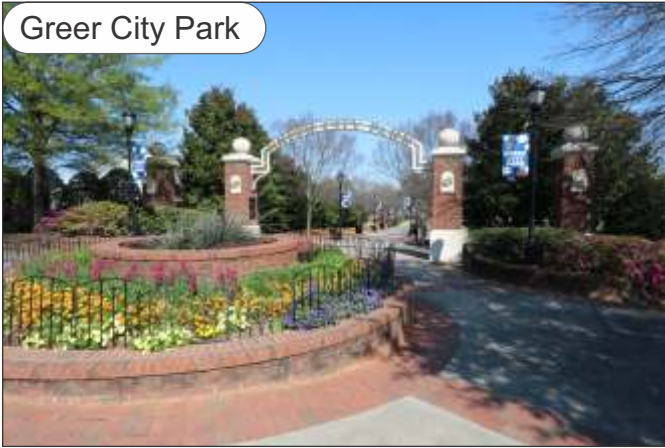
Greer City Park