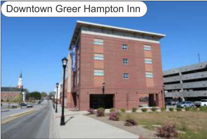
Downtown Greer Hampton Inn