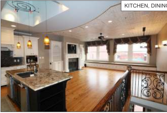
KITCHEN, DINING AND LIVING ROOM