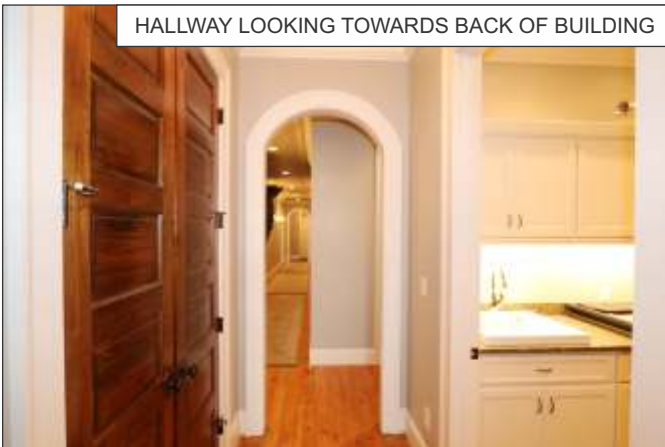
HALLWAY LOOKING TOWARDS BACK OF BUILDING