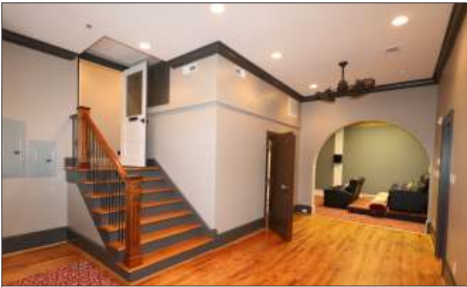
LOWER LEVEL WITH FULL BATH, OFFICE, SAUNA & THEATER