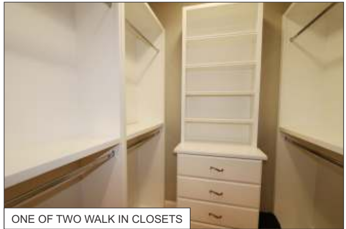
ONE OF TWO WALK IN CLOSETS