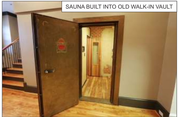
SAUNA BUILT INTO OLD WALK-IN VAULT