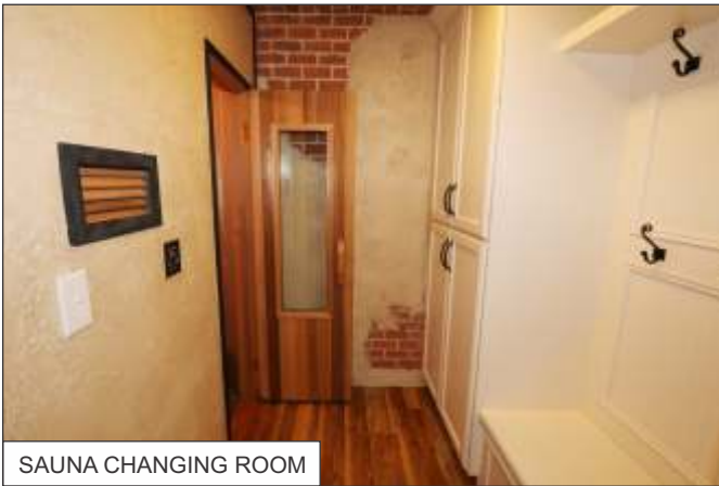
SAUNA CHANGING ROOM