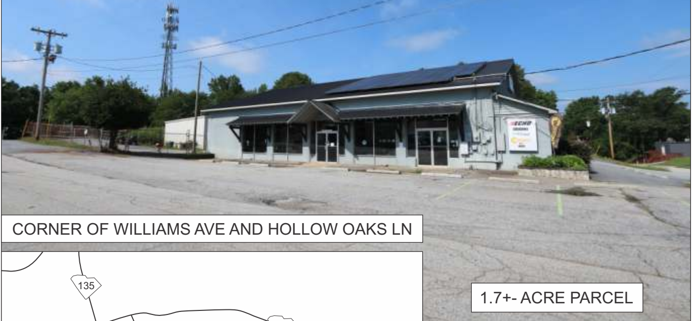
CORNER OF WILLIAMS AVE AND HOLLOW OAKS LN

■ 2,150+- SF BUILDING 1,550+- SF SHOP WITH (2) 10'x10' DRIVE-IN DOORS 600+- SF UPSTAIRS AREA WITH RESTROOM LEASE RATE: $2,000/MO