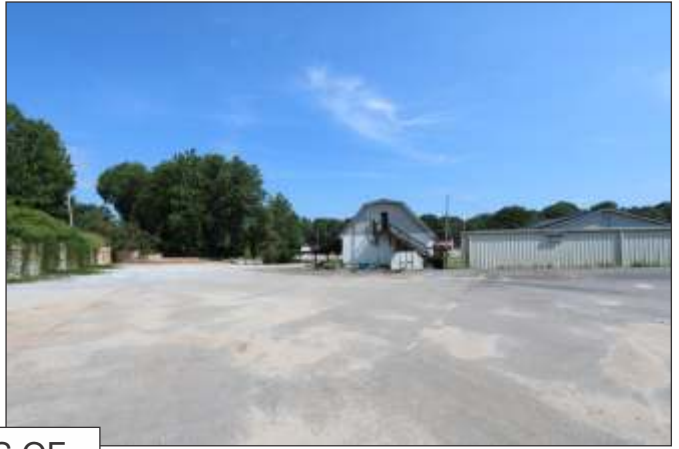
VIEWS OF YARD SPACE