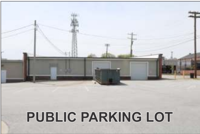
PUBLIC PARKING LOT