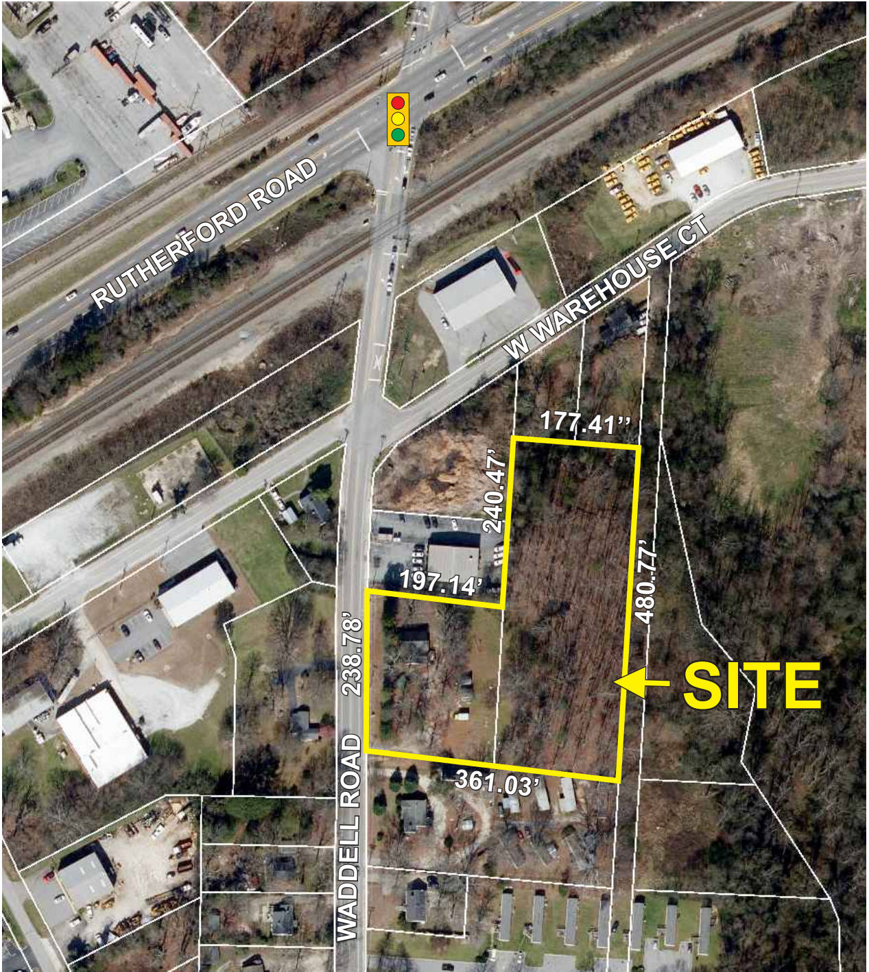
MEASUREMENTS FROM SURVEY DONE BY SITE DESIGN ON 10/1/2019