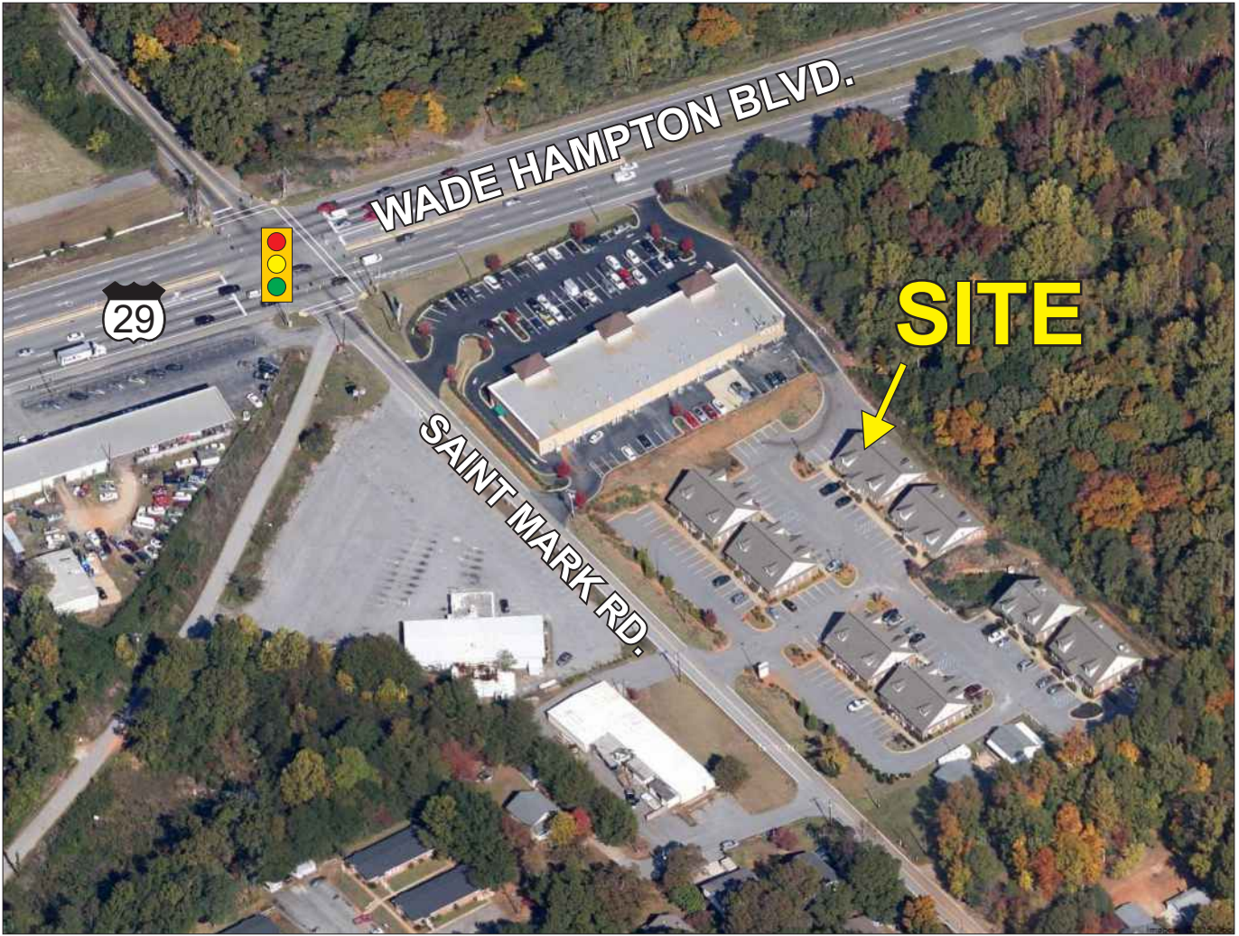
ZONED GREENVILLE COUNTY C2 TAX MAP: T008.00-03-033.03