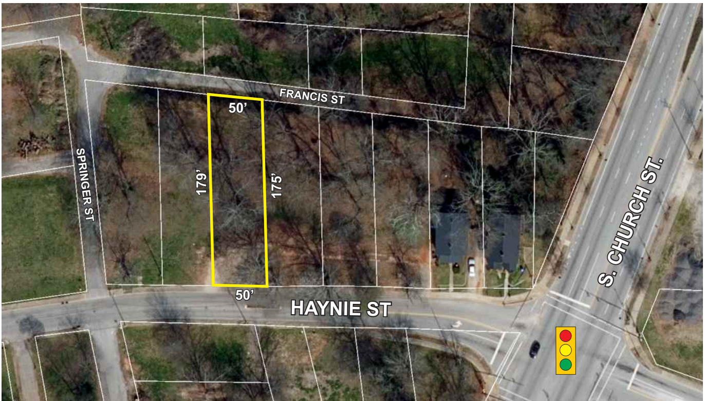
MEASUREMENTS ESTIMATED FROM GREENVILLE COUNTY GIS