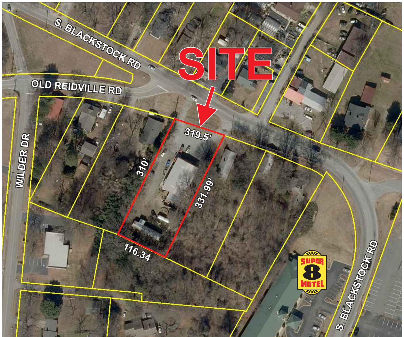
PARCEL MEASUREMENTS FROM SPARTANBURG COUNTY GIS SPARTANBURG COUNTY TAX MAP 6-20-16-041.00