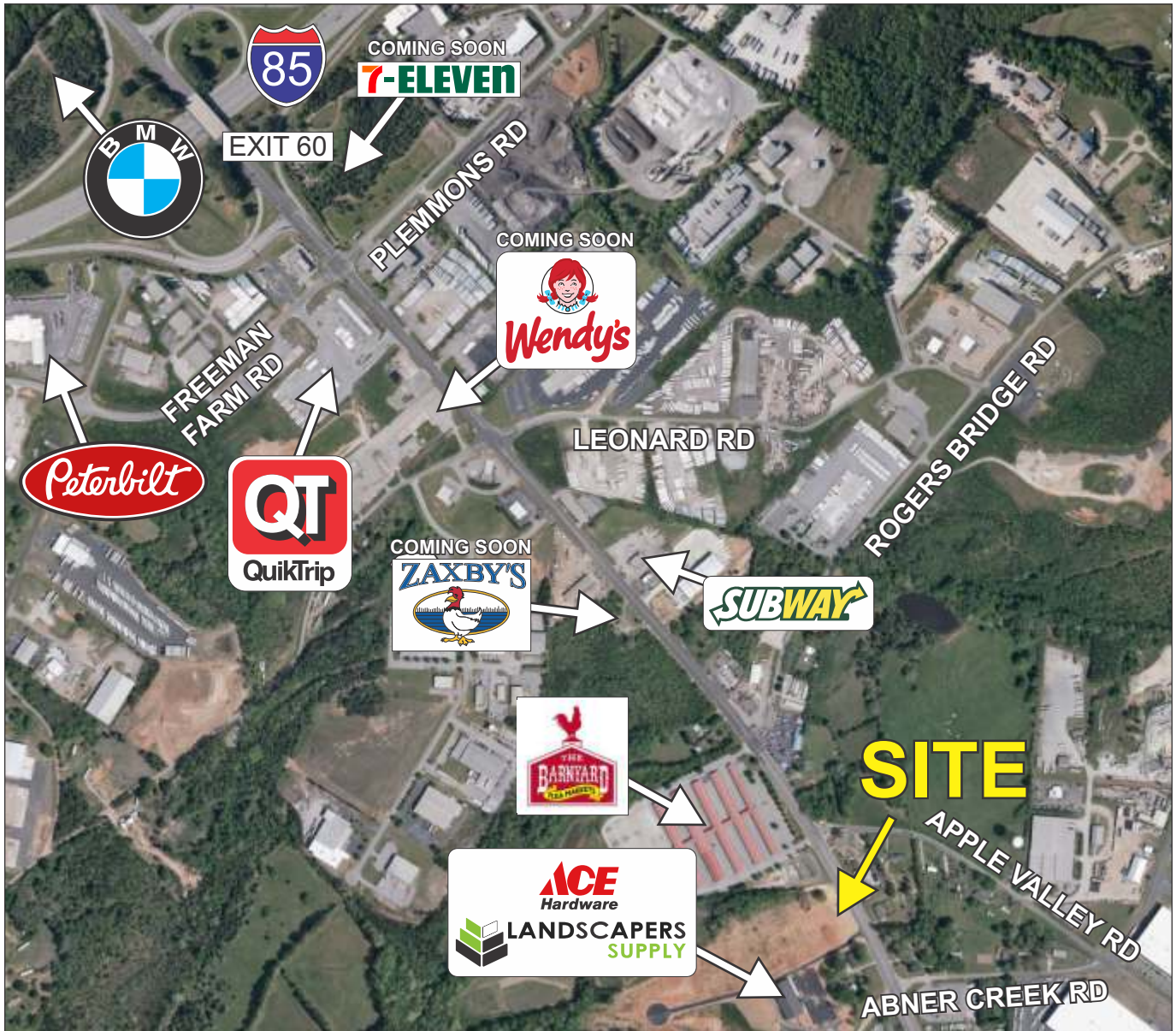
2+- ACRE PARCEL AT THE CORNER OF HWY 101 AND THE ACCESS ROAD TO THE NEW ACE HARDWARE / LANDSCAPER SUPPLY BUILDING