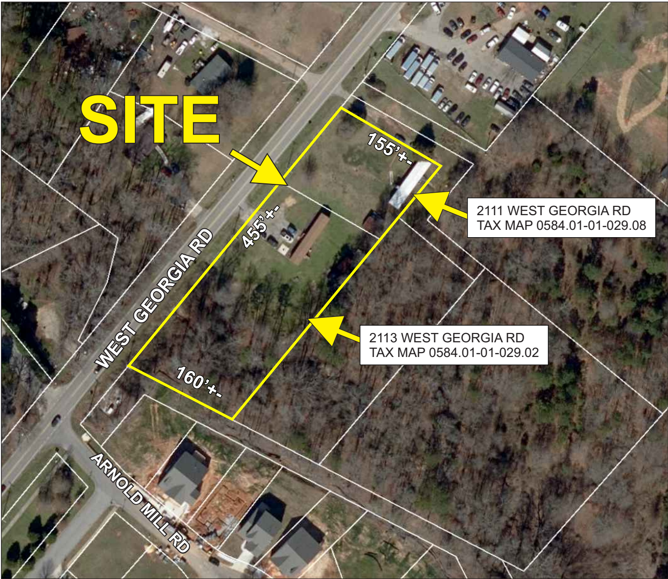
MEASUREMENTS ESTIMATED FROM GREENVILLE COUNTY GIS