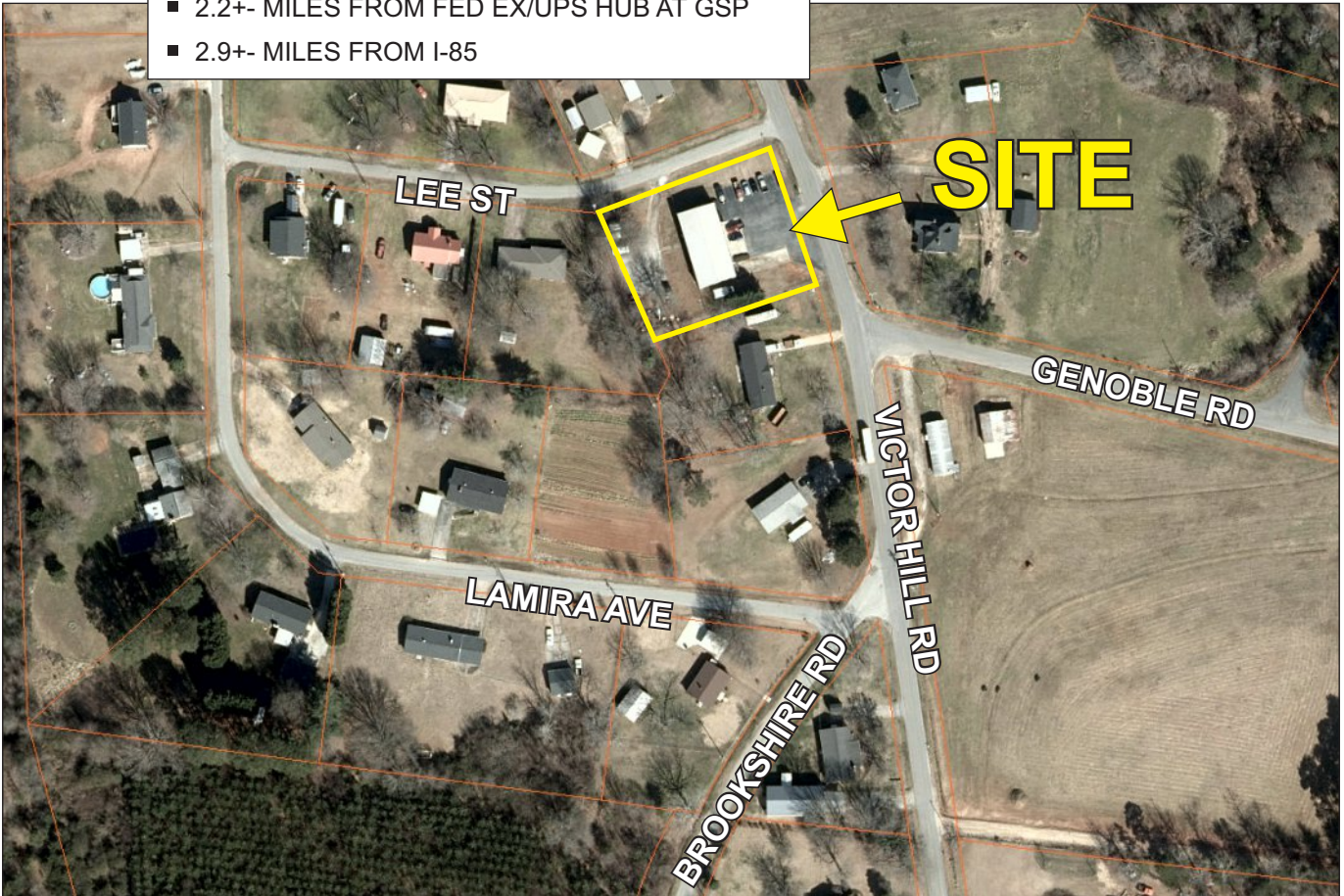
SPARTANBURG COUNTY TAX MAP 5-19-00-077.00