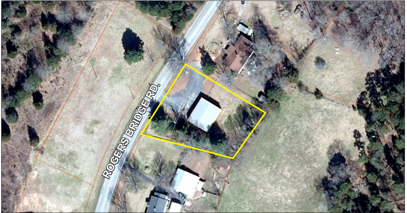
SPARTANBURG COUNTY TAX MAP 5-29-00-130.01