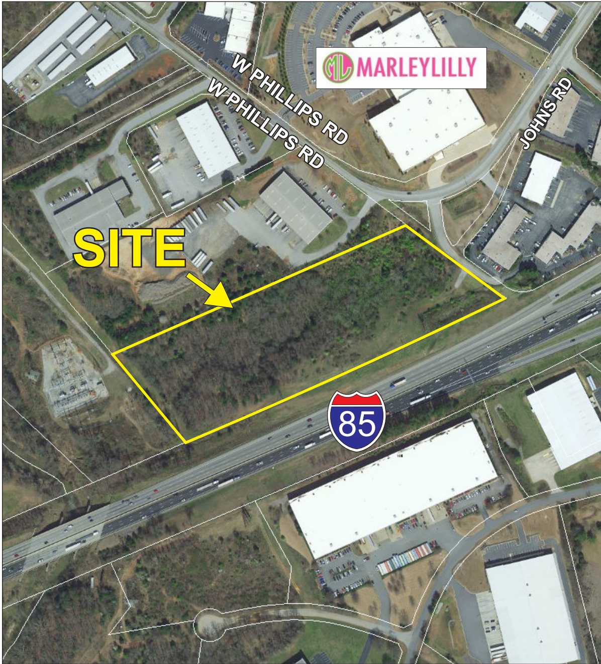
GREENVILLE COUNTY TAX MAP 0530.05-01-014.03