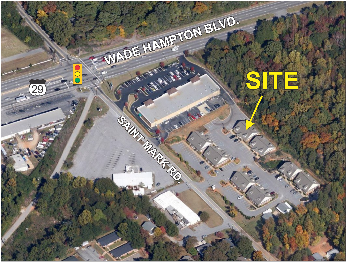
ZONED GREENVILLE COUNTY C2 TAX MAP: T008.00-03-033.03