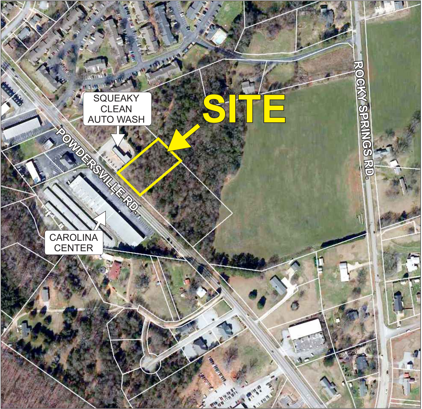
PICKENS COUNTY TAX MAP 5038-06-39-7097