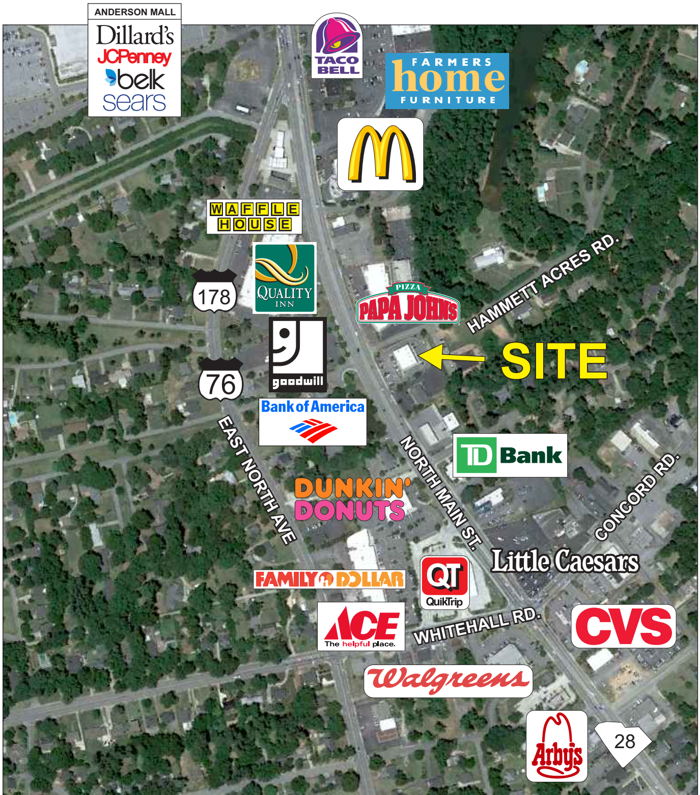
ANDERSON COUNTY TAX MAP 12213-02001