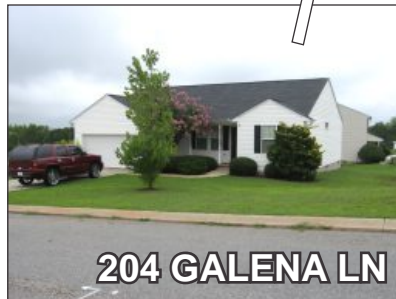
204 GALENA LN