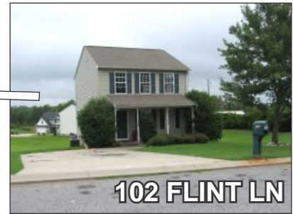
102 FLINT LN