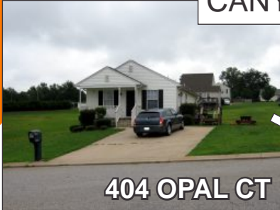
404 OPAL CT

102 FLINT LN - 3 BED/2 BATH 1344 SF - TM 5-18-00-067.00