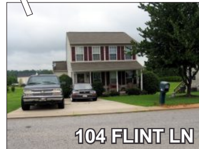
104 FLINT LN

IN GREER CITY LIMITS - ON PUBLIC WATER & SEWER