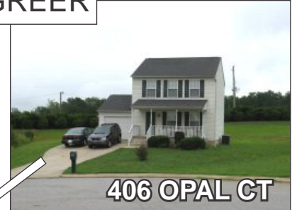
406 OPAL CT