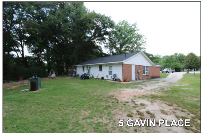
5 GAVIN PLACE

3 GAVIN PLACE: TAX MAP T034.02-01-048.00