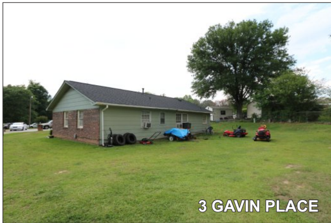
3 GAVIN PLACE