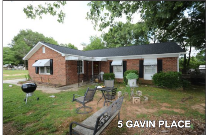
5 GAVIN PLACE