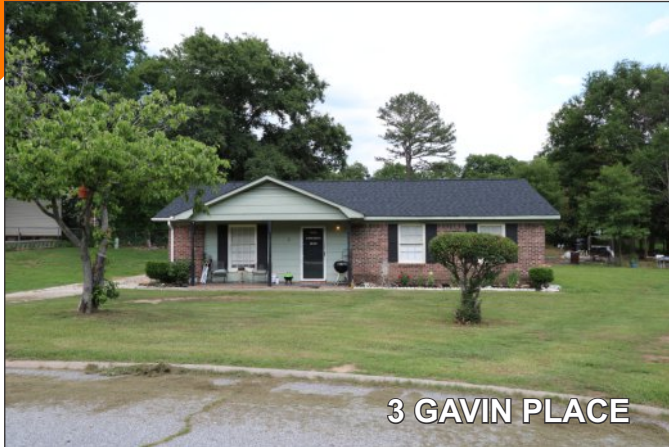
3 GAVIN PLACE