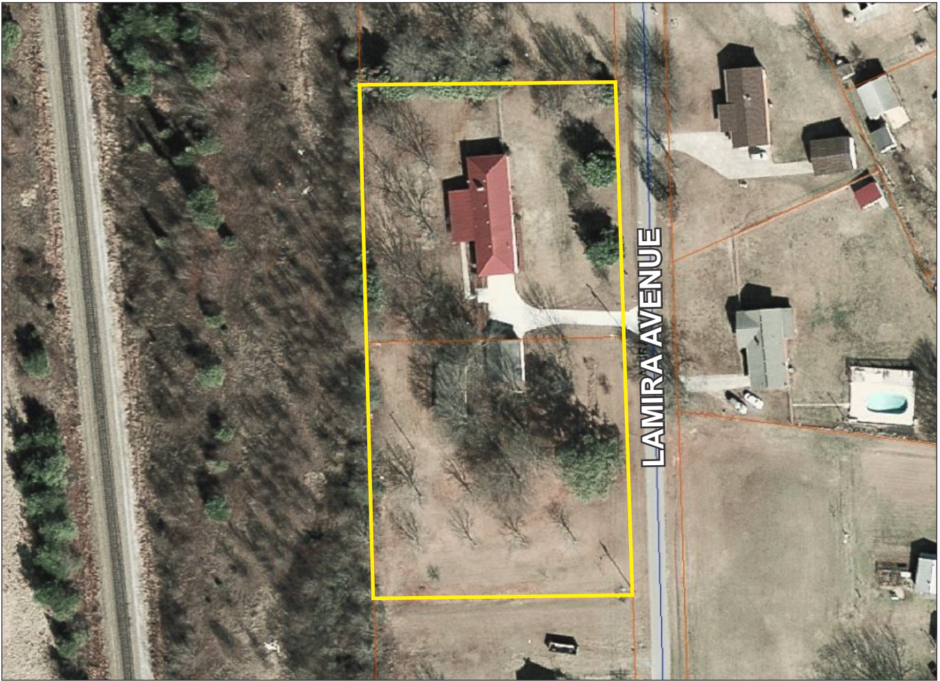
SPARTANBURG COUNTY TAX MAP 5-19-00-095.00 & 095.01