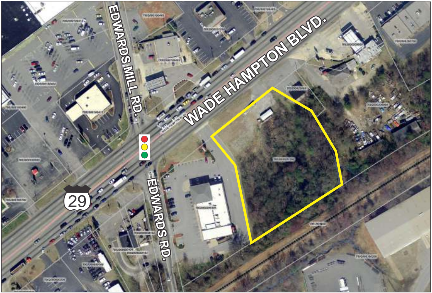
TAX MAP T002.00-02-010.00 ZONED GREENVILLE COUNTY C2