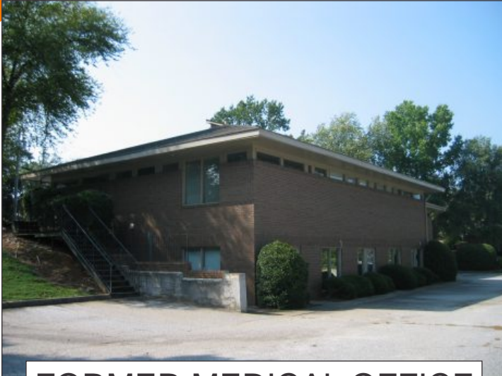
FORMER MEDICAL OFFICE

TAX MAP 0105.00-02-020.03 IN GREENVILLE CITY LIMITS