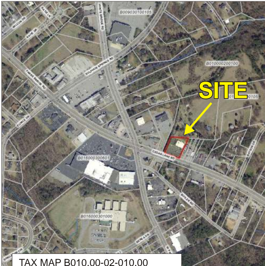
TAX MAP B010.00-02-010.00 ZONED GREENVILLE COUNTY C2