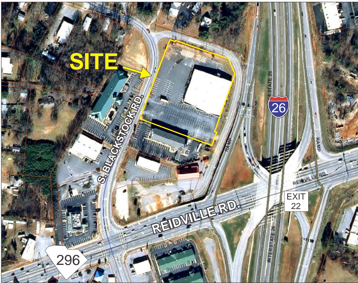
TAX MAP 6-20-16-053.02 - UNZONED IN SPARTANBURG COUNTY