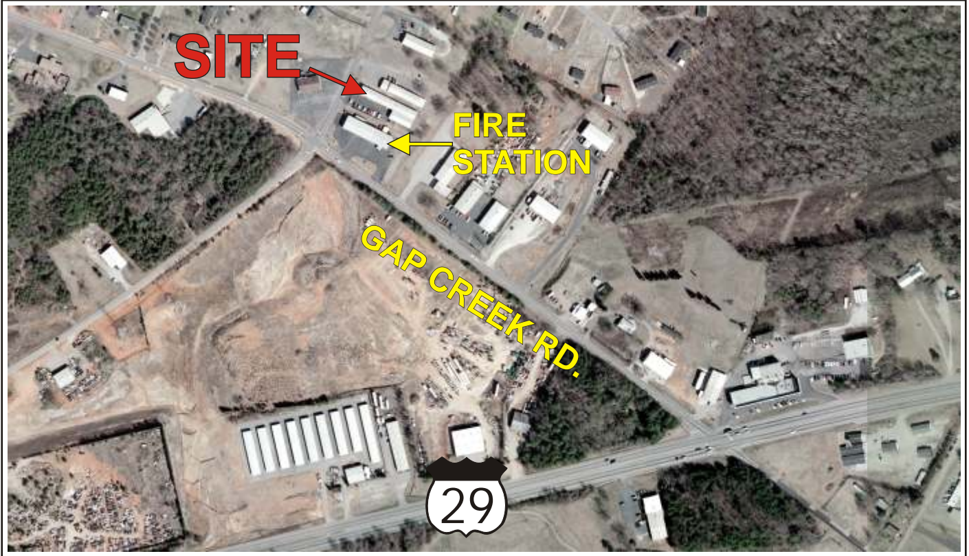
TAX MAP 5-14-00-12.01 BUILDING IS LOCATED WITHIN LYMAN CITY LIMITS