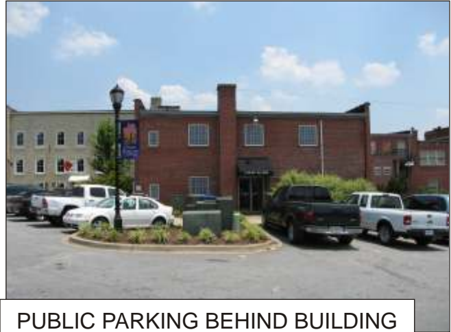
PUBLIC PARKING BEHIND BUILDING