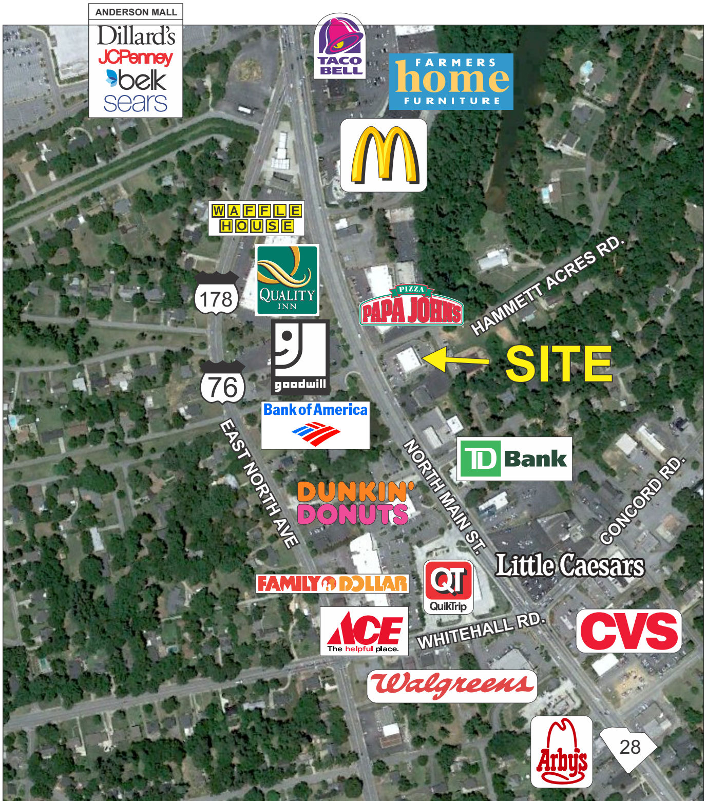
ANDERSON COUNTY TAX MAP 12213-02001