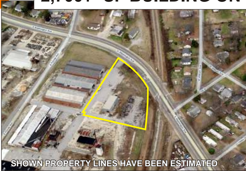
SHOWN PROPERTY LINES HAVE BEEN ESTIMATED