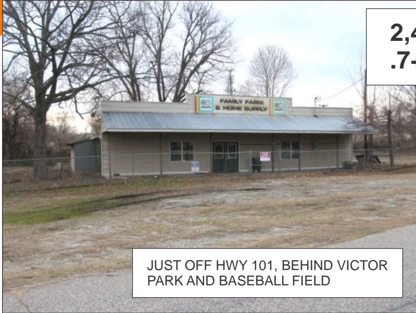
JUST OFF HWY 101, BEHIND VICTOR PARK AND BASEBALL FIELD

2,450+- SF BUILDING ON .7+- ACRE FENCED LOT