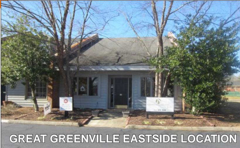
GREAT GREENVILLE EASTSIDE LOCATION

2 STORY OFFICE: DOWNSTAIRS HAS 5 EXAM ROOMS, RECEPTION ROOM, WAITING ROOM AND 2 RESTROOMS. UPSTAIRS HAS BREAK ROOM, OFFICE AND 2 RESTROOMS.