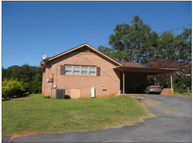
LOCATED IN LYMAN CITY LIMITS