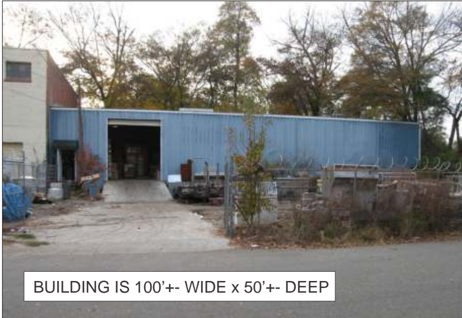
BUILDING IS 100'+- WIDE x 50'+- DEEP

5,000+- SF METAL BUILDING ON .249+- ACRE PARCEL