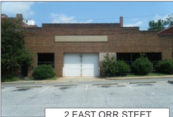
2 EAST ORR STEET

300 North Main St. (TAX MAP 123-29-19-001 & 013) An 11,000+- sf building that well know throughout the city, built in the 1880's-1890's. Although over 100 years old, the building has been updated throughout for office use. The building features the following: