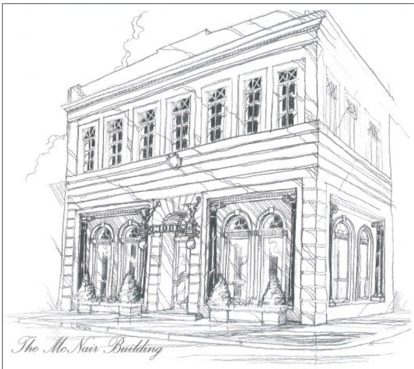
Artist rendering of what 300 North Main Street could look like with an exterior renovation.

Adjacent public parking lot will service up to 55+ spaces for parking. Both properties zoned City of Anderson Central Business District (CBD)