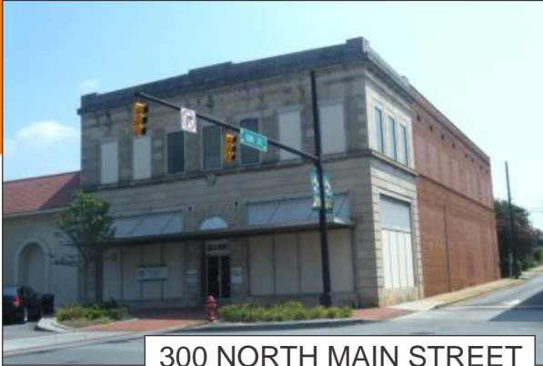
300 NORTH MAIN STREET