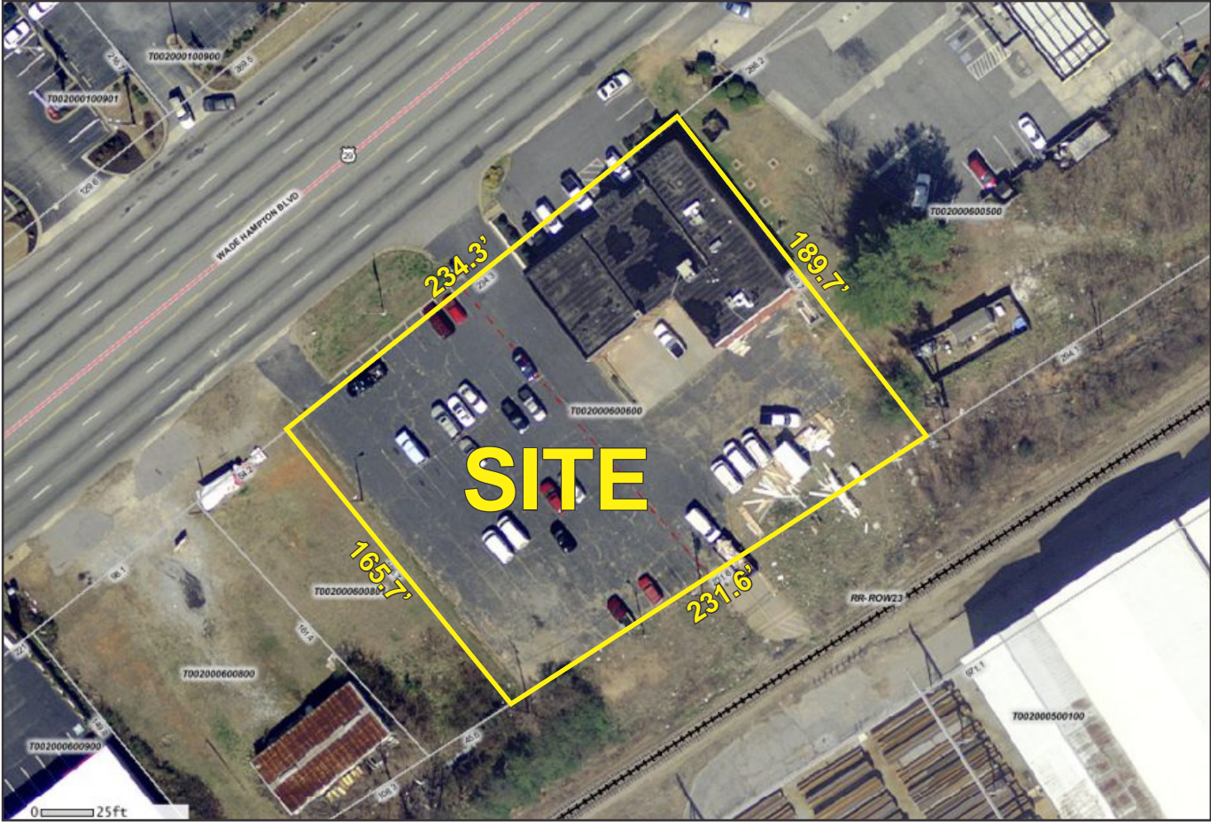
MEASUREMENTS FROM GREENVILLE COUNTY GIS