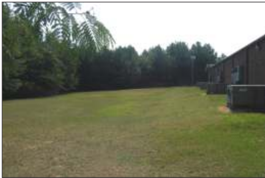
REAR AREA FOR FUTURE DEVELOPMENT