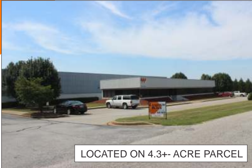
LOCATED ON 4.3+- ACRE PARCEL

32,400+- INDUSTRIAL BUILDING WITH AN ADDITIONAL 7,500+- SF OF OFFICE SPACE IN THREE BUILDINGS