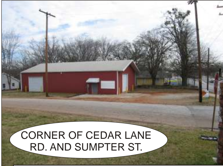
CORNER OF CEDAR LANE RD. AND SUMPTER ST.