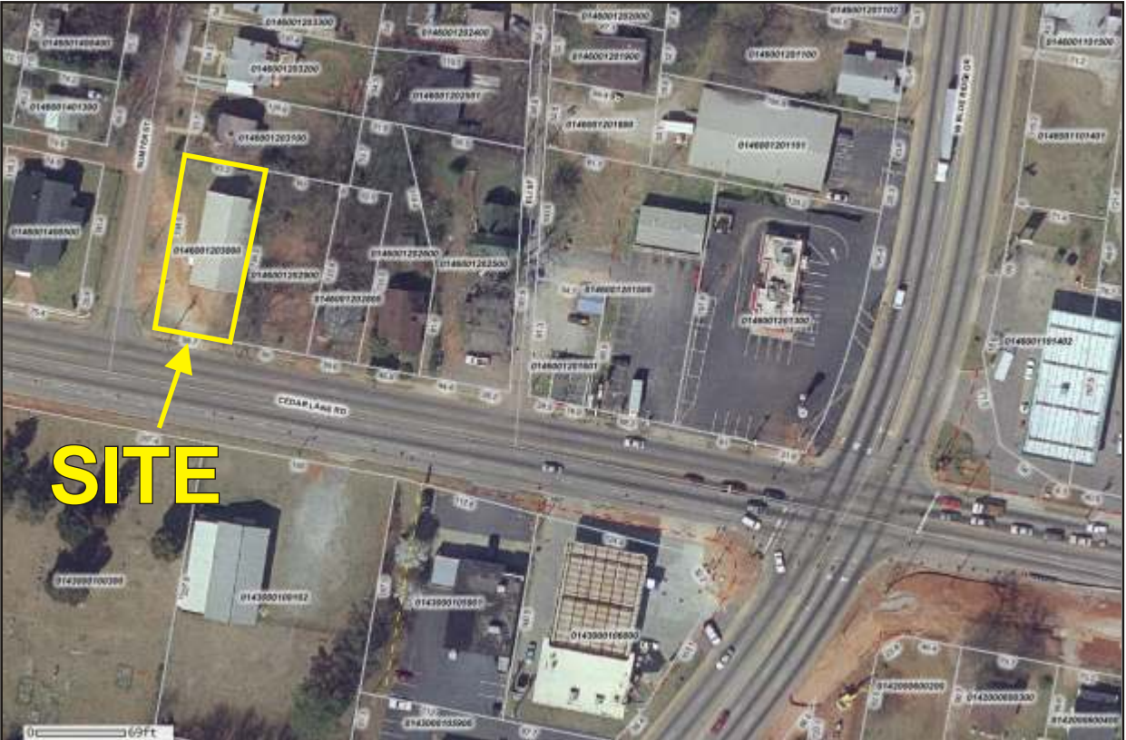
PROPERTY MEASUREMENTS FROM GREENVILLE COUNTY GIS. ALL MEASUREMENTS SHOULD BE CONFIRMED BY ACTUAL SURVEY