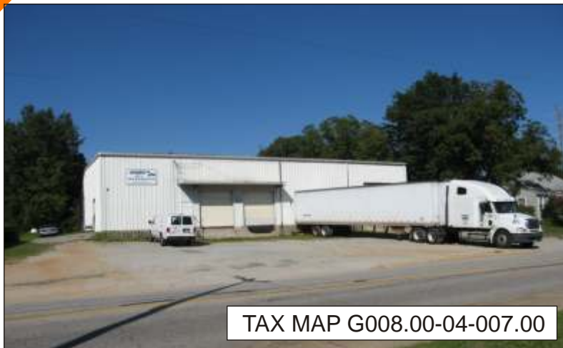
TAX MAP G008.00-04-007.00