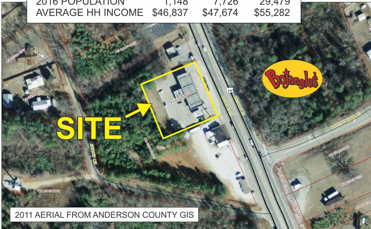
2011 AERIAL FROM ANDERSON COUNTY GIS