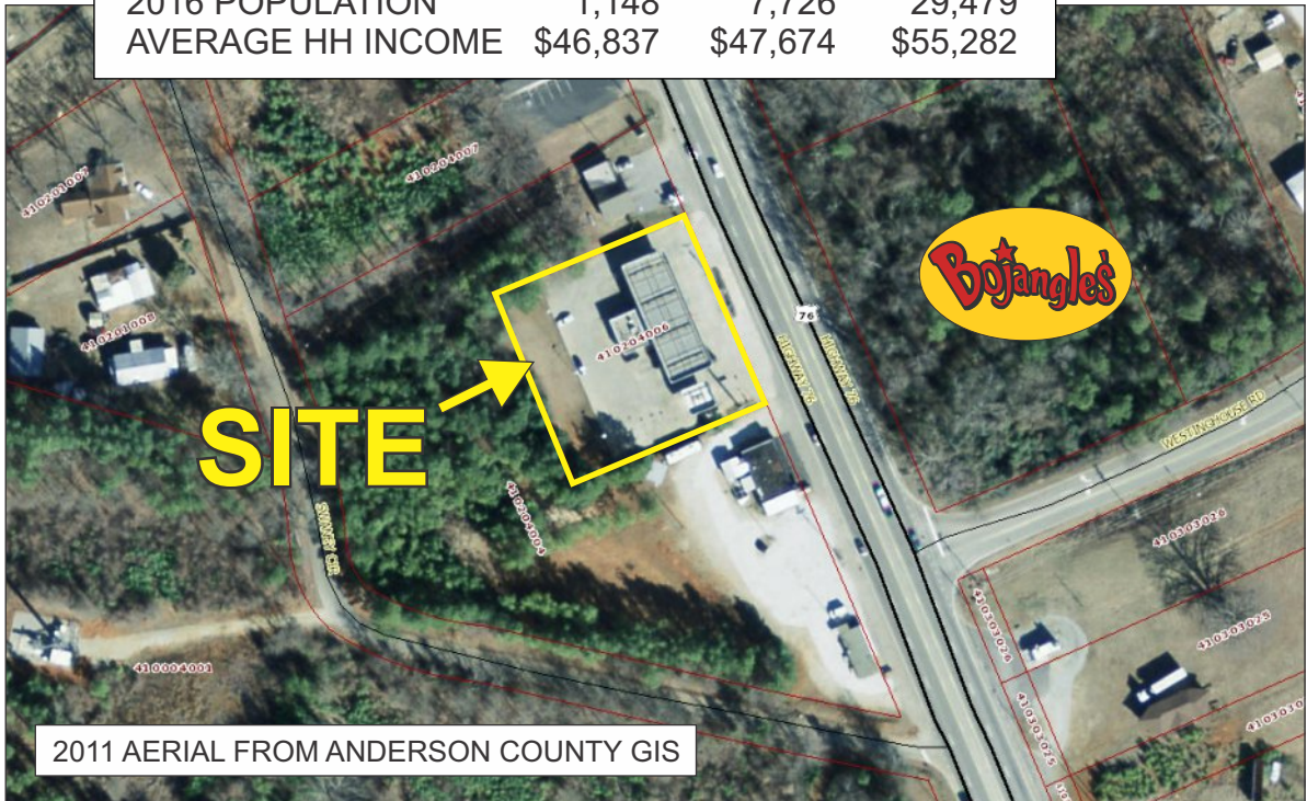
2011 AERIAL FROM ANDERSON COUNTY GIS