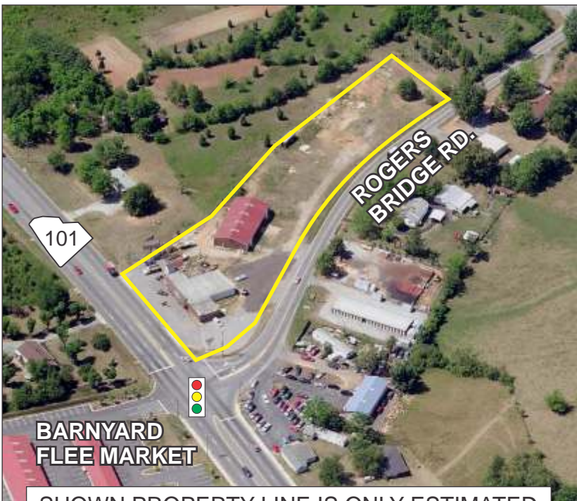
SHOWN PROPERTY LINE IS ONLY ESTIMATED