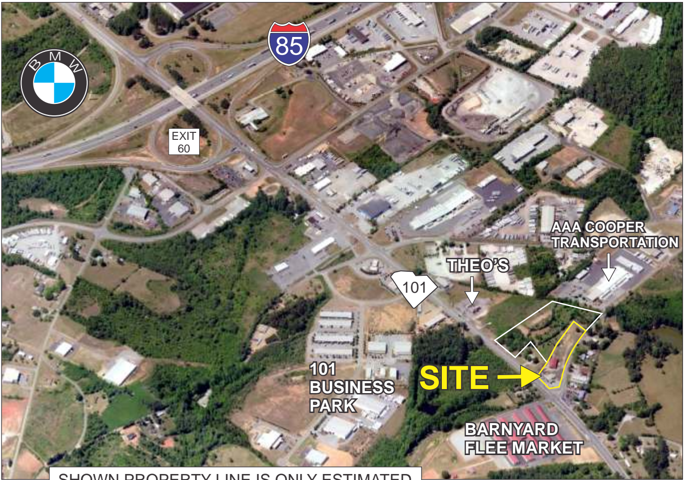
SHOWN PROPERTY LINE IS ONLY ESTIMATED