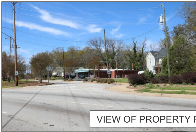
VIEW OF PROPERTY FROM PETE HOLLIS BLVD.