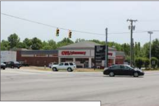
INTERSECTION OF HWY 25 AND I-185