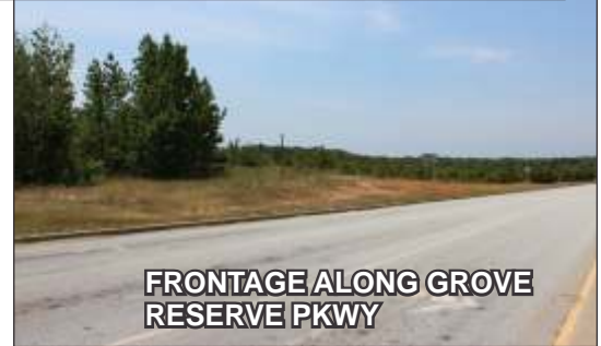
FRONTAGE ALONG GROVE RESERVE PKWY