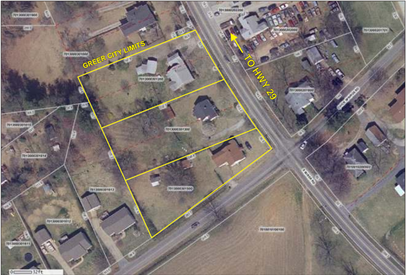
HOUSES CURRENTLY LOCATED ON ALL THREE PARCELS