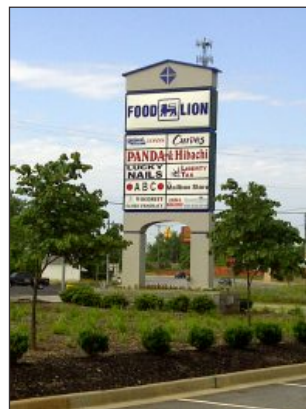
WOODRUFF CROSSING SHOPPING CENTER ANCHORED BY FOOD LION