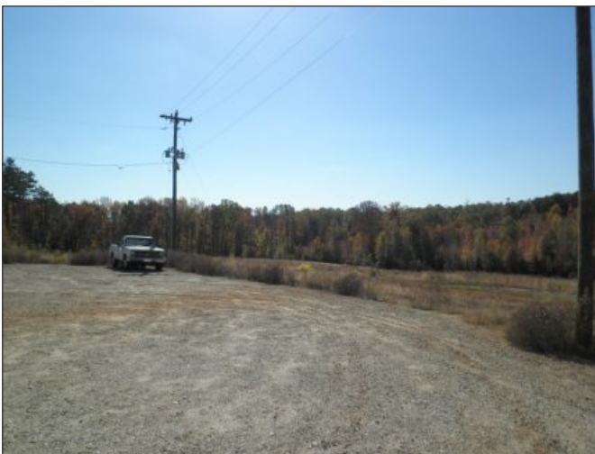
2010 TRAFFIC COUNT: 16,100 VPD (SC DOT COUNT STATION 103)