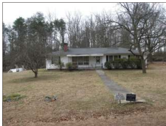
1,500+- SF HOUSE

ADJACENT TO PROPERTIES ZONED S1 AND I1 AND GREER CITY LIMITS