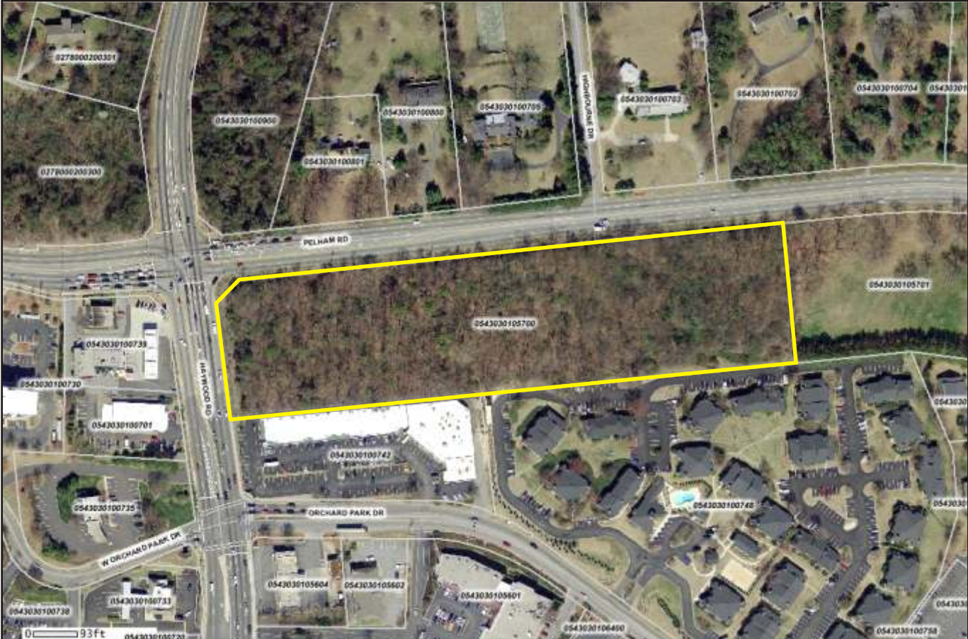
TAX MAP 0543.03-01-057.00